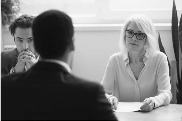
PHOTO 1.2 Interviews can provide important insight into white-collar criminal behavior. While white-collar professionals might be open to doing interviews, it is very difficult to convince white-collar offenders to be interviewed.