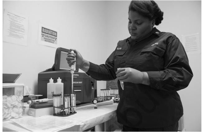
U.S. Government Work

Many individuals assume that a trip to the auto mechanic has the potential to result in unnecessary repairs and outrageous bills. Few, however, assume that trips to the doctor or pharmacist might result in similar outcomes. As will be shown later in this text, however, white-collar crime research shows that misconduct occurs in all occupations. By understanding misconduct in these occupations, we better understand the occupational subcultures where the misconduct occurs.