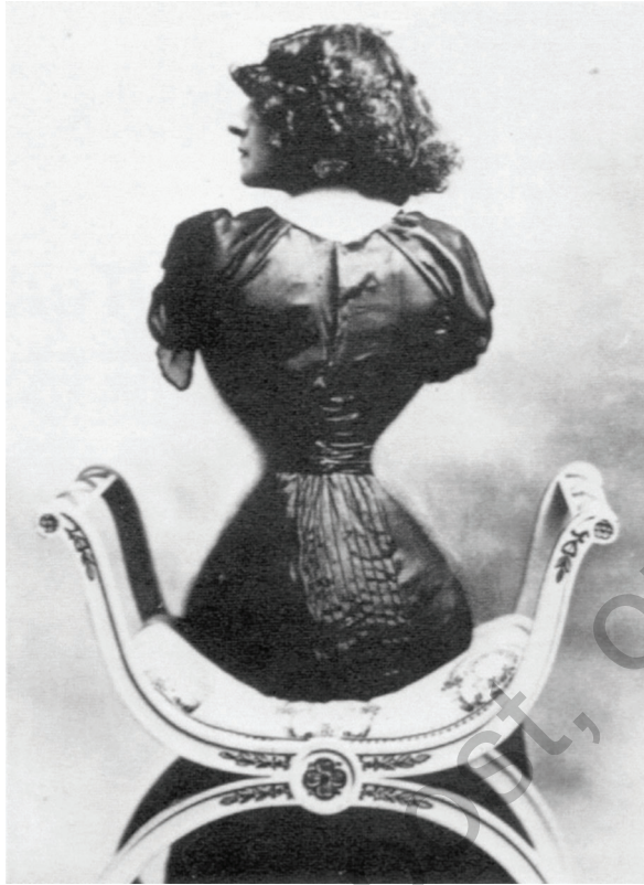
Corsets, stiff undergarments that could be tightened to constrict women's waists, were once common.

how your life would change if our form of government changed from a democratic republic to a dictatorship. Or imagine if our culture began to view obesity as a sign of prosperity, as was common in the Middle Ages and Renaissance. As our culture and social structures change, so does our society—and our lives within it.