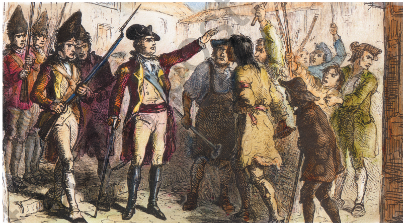
An engraving depicts the British colonial governor of North Carolina [center] suppressing a Regulators' revolt in 1771. Daniel Shays and other members of the rebellion in Massachusetts patterned their protests against the state government on the actions of the Revolutionary War Regulators.

Daniel Shays, a former captain in the Revolutionary War, joined the Regulators later than many but became a commander of its largest regiment, partly due to his notable service in the war. In January 1787, Shays's regiment and two others moved on the state armory at Springfield. Major General William Shepard, commanding the newly raised state militia and in possession of artillery that the Regulators lacked, defeated Shays and the rebels, who were forced to withdraw. Two rebel leaders were hanged, and most of the other rebels eventually returned to their farms and towns. Shays escaped to Vermont and was later pardoned, though he never returned to Massachusetts. With the help of the Boston newspapers, Daniel Shays became the personification of anarchy in the United States. In reality, most of the Regulators wanted only to keep their farms and keep their family and friends out of foreclosure or debtors' jail.