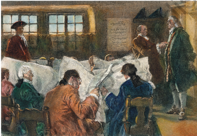
The fate of the Constitution was decided in the state ratifying conventions (nine states had to ratify for the Constitution to take effect), but it was the subject of intense debates everywhere—in homes, taverns, coffeehouses, and newspapers.

The Anti-Federalists were in the difficult position of having to argue against a proposal, since basing their argument only on what was good about the Articles of Confederation was a tough sell. So they turned negative. They raised fears in the minds of Americans about what this potentially radical change in the government would bring. Mostly, they argued, it would trample on the rights of the people and the states in which they lived.