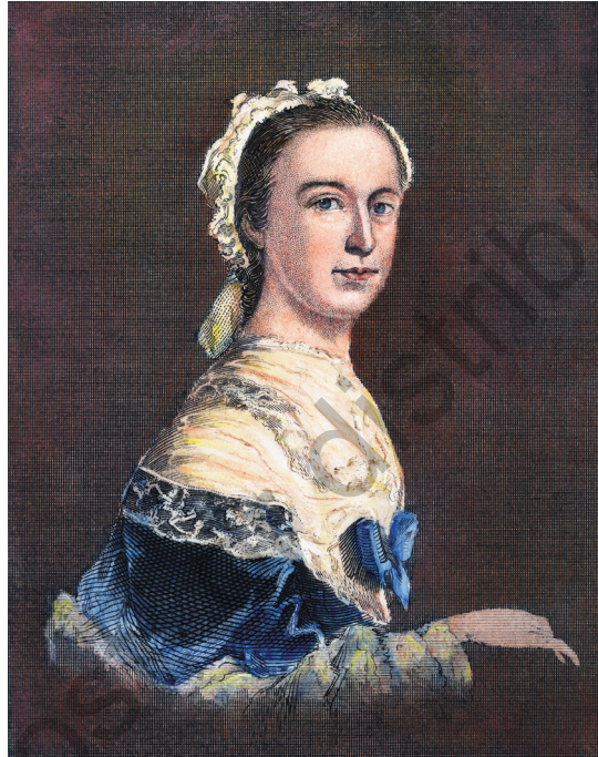
A nineteenth-century steel engraving depicting Mercy Otis Warren. Publishing anonymously, and often assumed to be a man, Warren warned against the omission of a bill of rights in the proposed Constitution.

As the state ratification conventions took up the debate, the lack of a bill of rights in the document became a powerful political tool for the Anti-Federalists, and the Federalists shifted gears in response. During the ratification campaign, sensing the realities of the political landscape, Madison promised to introduce a bill of rights as proposed amendments during the first session of the new Congress after the Constitution had been ratified.