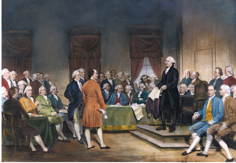
George Washington presiding at the Constitutional Convention at Philadelphia in 1787. Considerable measures were taken to ensure the secrecy of the proceedings at the convention.