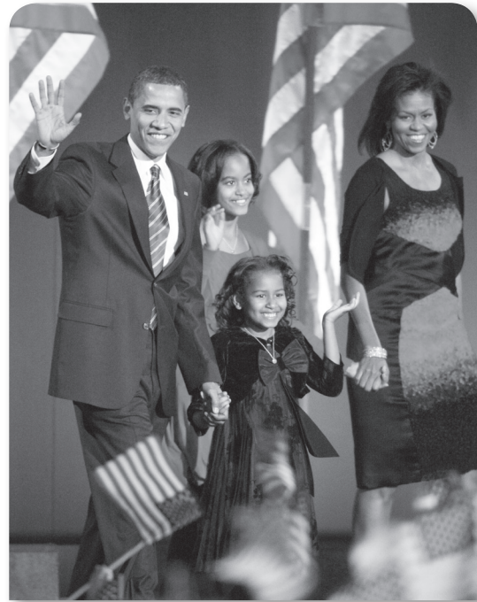
President Obama and family