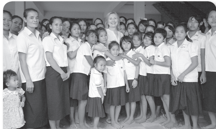
The faces of human trafficking : Victim to survivors